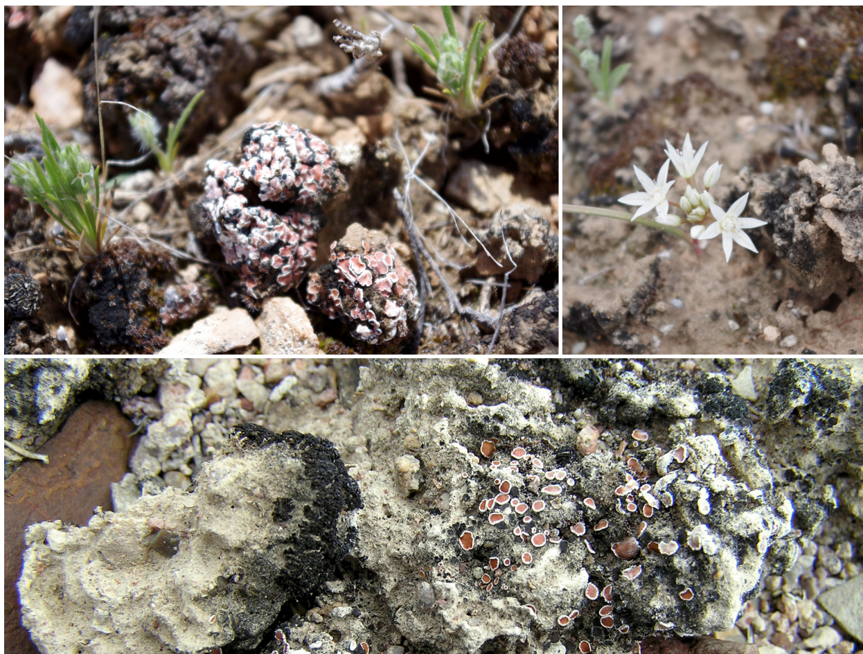
Soil crusts (top left, bottom), Allium (top right)