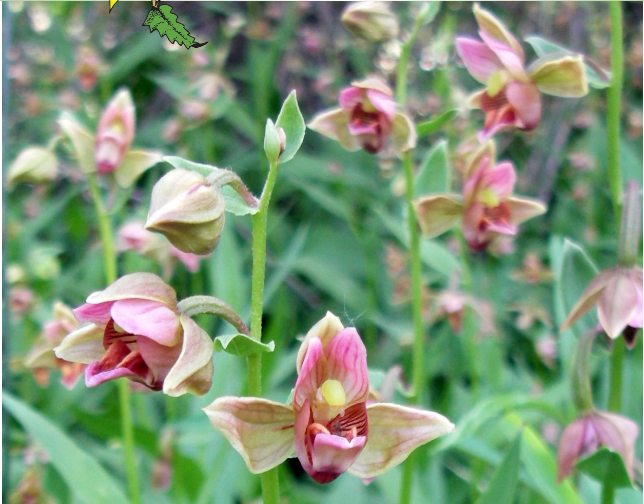
Epipactis gigantea (stream orchid)