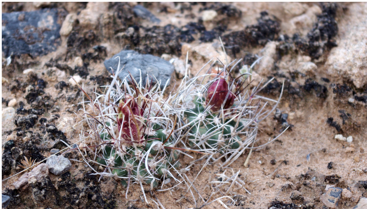
Sclerocactus - J. Johnson

Social time starts at 7:00 PM and the program starts at 7:30. The outside door will be automatically locked at 7:30.